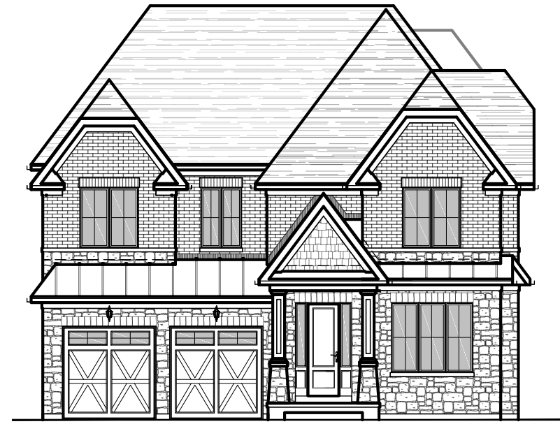
FRONT ELEVATION SCALE: AS NOTED ON PAGE