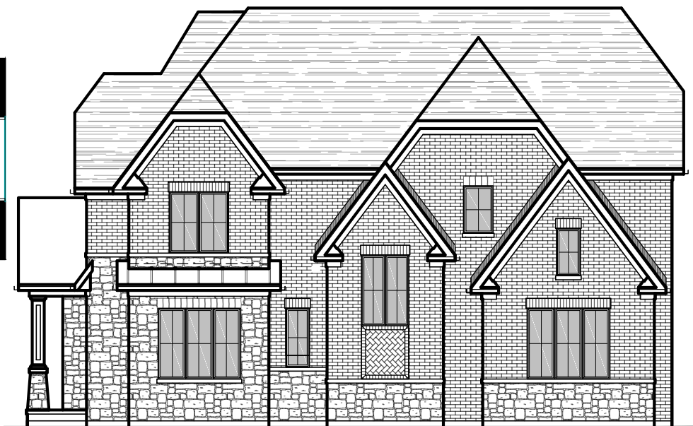
FLANKAGE ELEVATION SCALE: AS NOTED ON PAGE