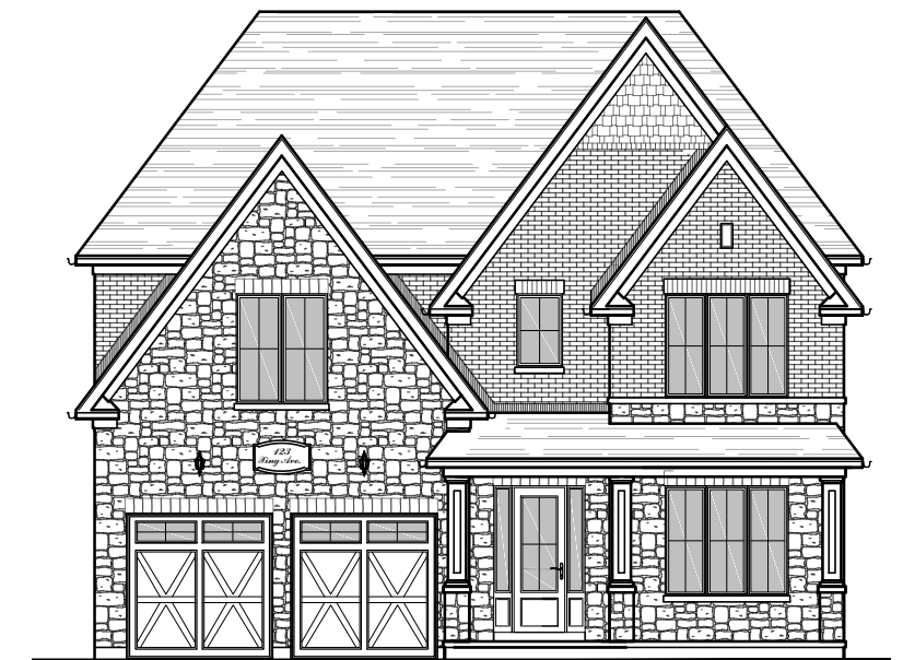
FRONT ELEVATION 'A' SCALE: AS NOTED ON PAGE