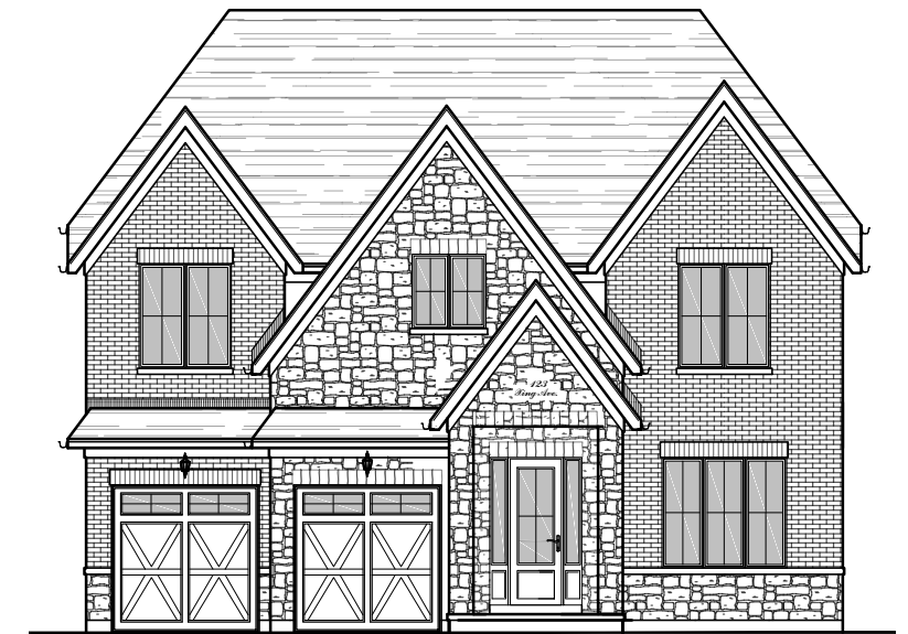
FRONT ELEVATION 'B' SCALE: AS NOTED ON PAGE